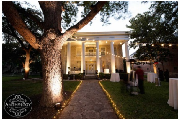
Neill Cochran House

Registration is limited. Registration: $30. Includes wine, beer, tea, coffee and water. FREE on-site parking; accessible.